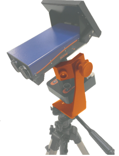
TA 800 Tripod Adaptor