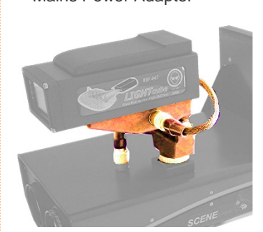
Hotshoe Adaptor For mounting LIGHTcubes